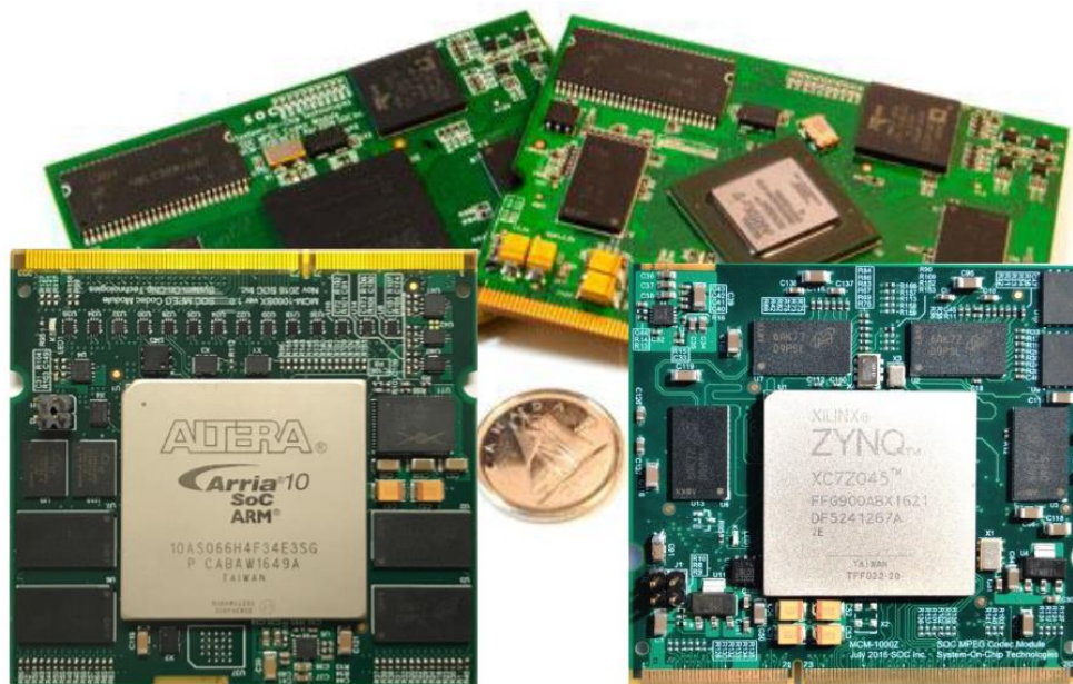
Fig. 1 SOC codec modules

Fig. 1 shows a photo of the modules. Fig. 2-5 shows the dimensions of MCM-1000S, MCM-1000A, MCM-1000Z, and MCM-1000SX respectively.