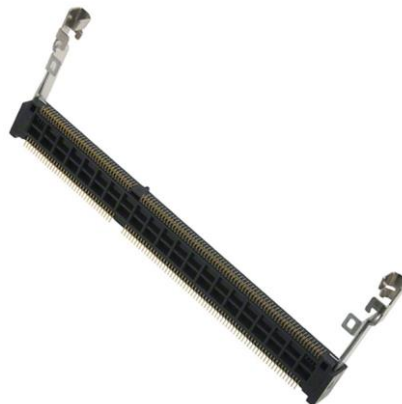
Fig. 6 A photo of the standard 204 pin DDR3 SODIMM connector

Fig. 6 shows a photo of a standard 204 pin DDR3 SODIMM PCB connector. Refer to the datasheet of the connector used for the physical dimension and PCB design requirements.