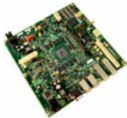
QorIQ Qonverge BSC9132 Development Board