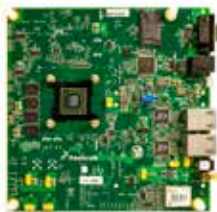
QorIQ Qonverge BSC9131 Reference Design Board

The QorIQ Qonverge line of products has a proven set of hardware and software tools for code development and debug. The CodeWarrior Development Studio is a comprehensive integrated development environment (IDE) that provides a highly visual and automated framework to accelerate the development of the most complex embedded applications. The CodeWarrior tools allow a consistent look and feel for developing code on both cores as opposed to competing solutions that may require multiple debugging platforms. In addition to the IDE, the BSC9131RDB and BSC9132QDS give you the ability to develop and test code on hardware systems before developing your own hardware solution.